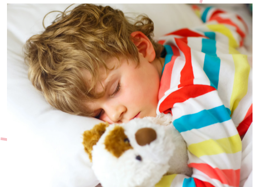
Rest easy knowing your home and family are protected around the clock from burglary or fire