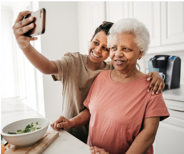
We all love our smart phones – now they can control lights, room temperature or appliances individually or grouped as one-touch "Scenes"