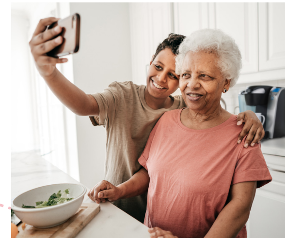
We all love our smart phones – now they can control lights, room temperature or appliances individually or grouped as one-touch "Scenes"