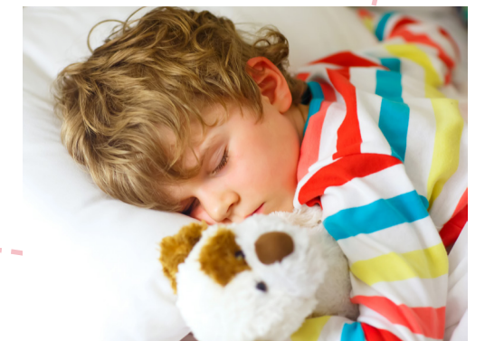
Rest easy knowing your home and family are protected around the clock from burglary or fire