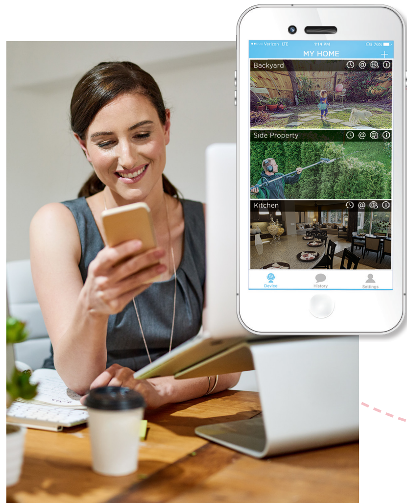
Look in on your home, family, nanny or pets anytime, from anywhere, with any smart phone or tablet, and receive text notifications & video alerts when the kids get home from school, dad takes his meds or if an event or alarm occurs, etc.