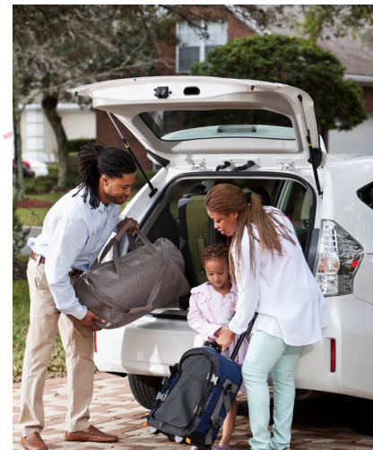
Peace of mind while out for the day or away on vacation