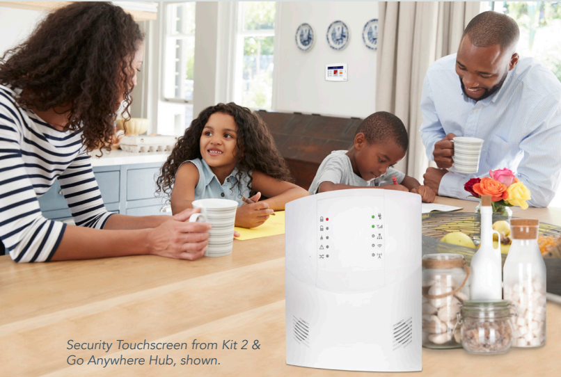
Security Touchscreen from Kit 2 & Go Anywhere Hub, shown.