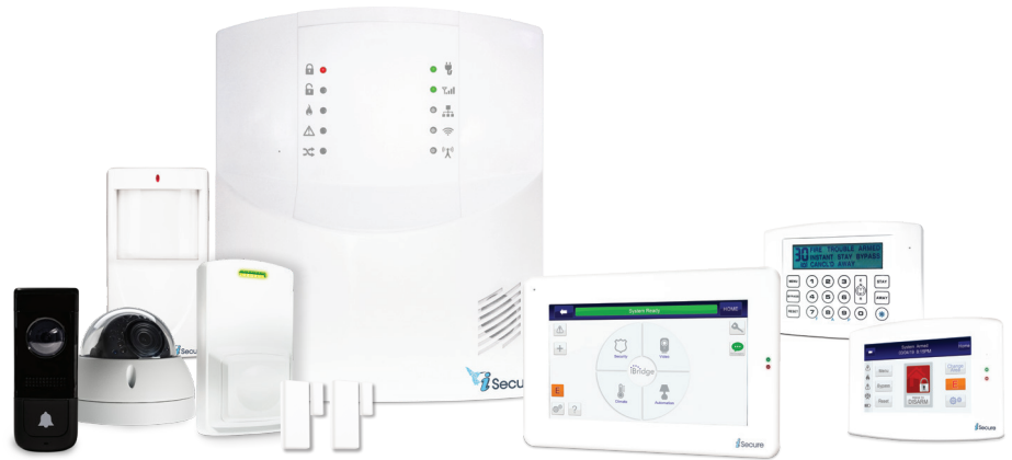
Complete Pro Grade Cell/IP System Kits with Smart Hub, 3 Sensors, Connected Home App & Alerts, Choice of Wireless Devices, Video Cameras & Doorbell