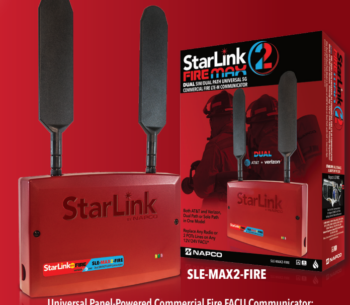
Universal Panel-Powered Commercial Fire FACU Communicator: Dual SIM for 2 Networks; Dual Path Cell Only or Cell/IP All in One Model verizon 🗸 📚 AT&T

One Dual SIM Dual Path Model is Both Verizon and AT&T and Sole or Dual Path with Cellular + Internet Option. StarLink Fire provides full data reporting, in sole & dual path, as a primary or backup, to any central station of your choice, w/o requiring any special equipment. Super Dual<sup>™</sup> Exclusive Supervised Dual Cell, Dual Path Plan Option (w/o using IP) Industry's 1st UL 864 Listed Supervised Dual Sim, Dual Path Communications -Uses 2 cell networks; both carrier channels are supervised. If one network is down, the other will be on. UL 864 Listed Dual Supervised , Dual Cell Channels , avoids use of IP for AHJ/regions' dual path requirement. A selectable plan option on NapcoComnet.com