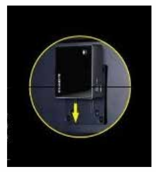
Flexible mounting options

For more information, please contact your local sales representative or contact Continental Access directly at (631) 842-9400.